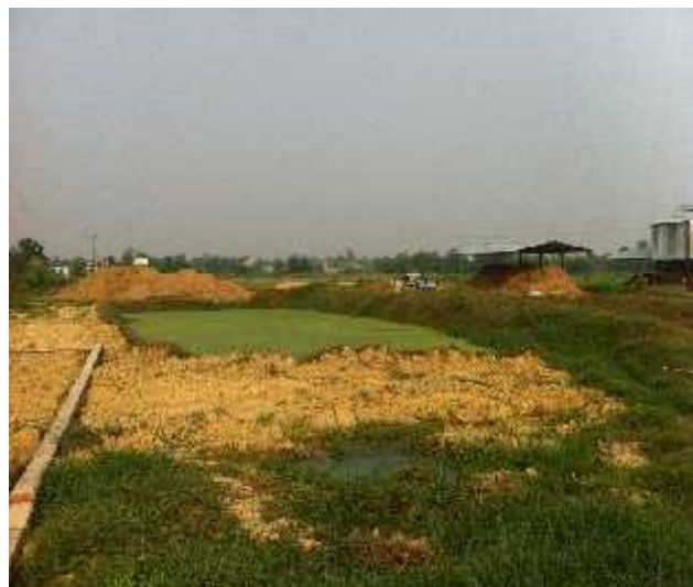
Picture 2-3: Waste disposal pond at Lumbini Agro Products and Research Centre

Lumbini Agro Products and Research Centre, Rupandehi was established about 5 years ago in 2008 in Tikuligadh VDC, Rupandehi. Currently, the farm is spread over 32 Bigha (216,717 m 2 ). During the discussion with the farm official, the farm currently has a total population of 269 cows, and about 3,374 Kg of dung and 2,638 litre of urine are produced daily. All of the wastes from the farm are disposed into open ponds built within the premise of the farm.